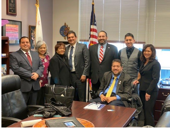
Meeting with Senator Ben Hueso